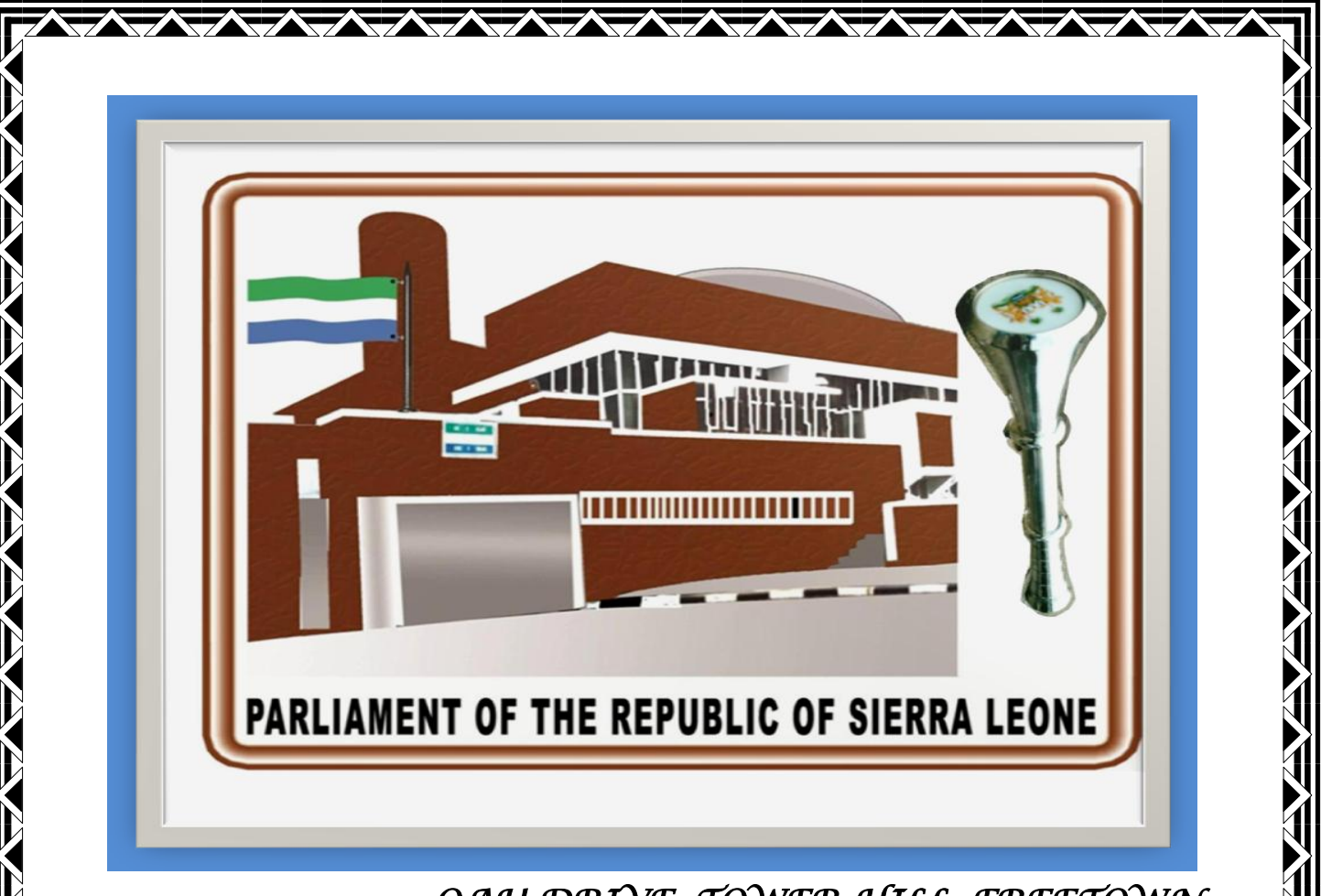
OAU DRIVE, TOWER HILL, FREETOWN